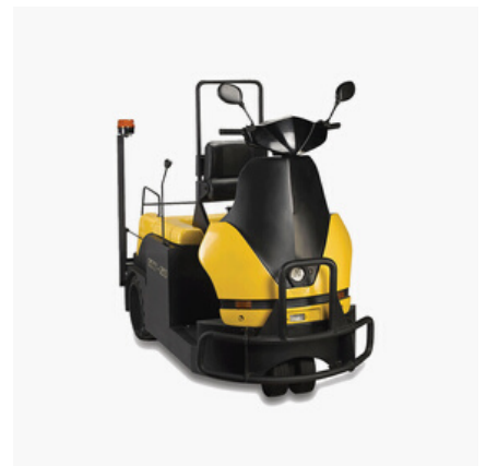
GROUND MOMENT VEHICLE