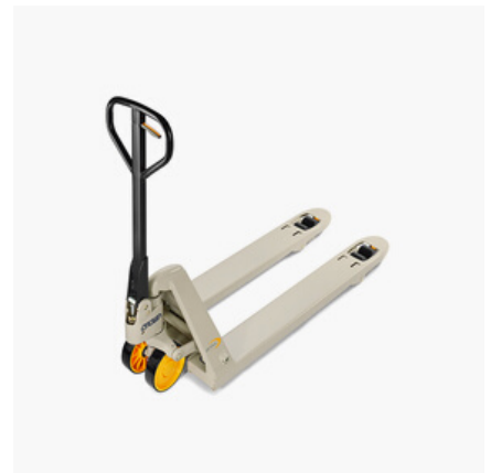
HYDRAULIC HAND PALLET TRUCK